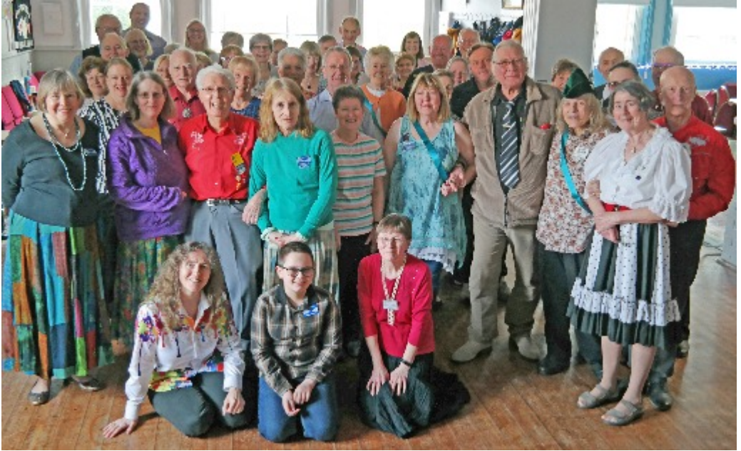
Not too easy, but can you spot Robin Hood among all the attendees ?

for his unwavering support in running Yorkshire Coast Waves. He's my roadie, our treasurer, our front of house and, when necessary, our chef and our bouncer! A man of many talents.