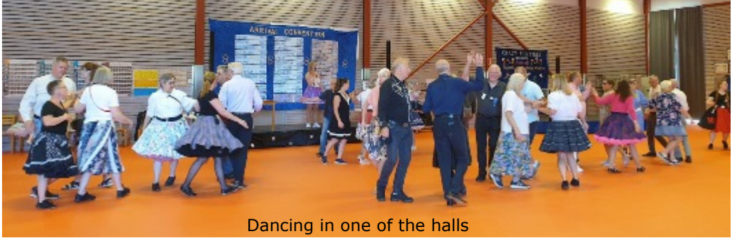
Dancing in one of the halls

sessions were well attended, with some people dropping out of one and joining another at the end of the allotted hour. Daytime dancing took place Friday/Saturday/Sunday from about 11.00-19.00, then a break and parties in the evening (Friday and Saturday)! We danced in full square dance costumes all morning and all afternoon, with a short break for lunch (we didn't want to