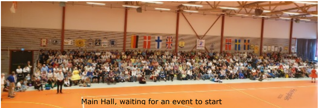
Main Hall, waiting for an event to start

The convention was held in a Sports complex with three very large halls for dancing and an extra hall at the nearby Folk School. On registration we were given a camping pitch on the field for motorhomes and caravans next to the sports complex (interestingly at the bottom of the practise ski slope) and joined the other units on the field. We also received that all-important 'dangler' to attach to our badges, our 'entry pass to everything' for the Convention. Friday 7th June 2024 about 500 square dancers had registered, by Saturday there was 650 of us who had gathered for a weekend of square dancing. Beginning on